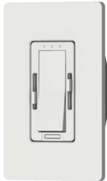
RGB WALL SWITCH