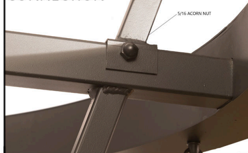
BOTTOM OF ARM CONNECTION