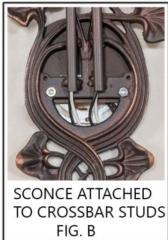
SCONCE ATTACHED TO CROSSBAR STUDS FIG. B