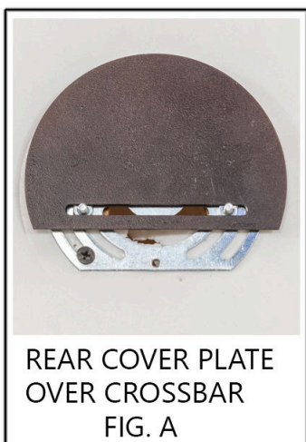
REAR COVER PLATE OVER CROSSBAR FIG. A