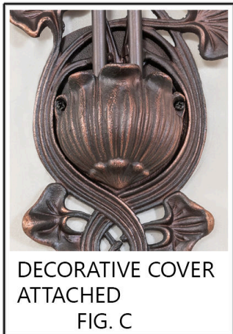
DECORATIVE COVER ATTACHED FIG. C