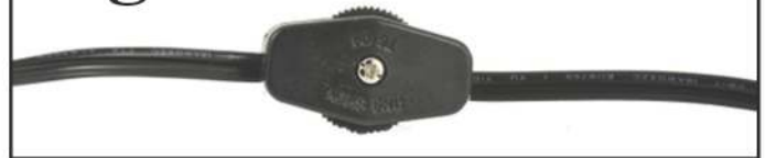
Fig.4 (In line switch)