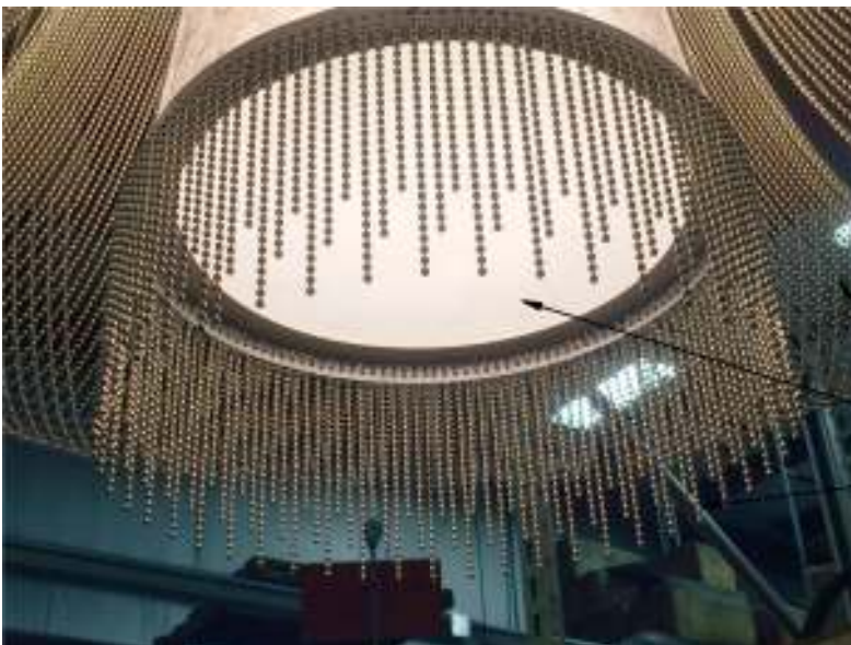
SHADE BEAD PATTERN DETAIL